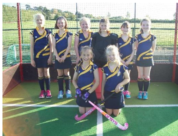
HCJS U10 girls at the RGS Tournament this week