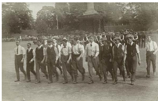
Recruits to the Hereford Regiment drilling on Castle Green Aug/Sep 1914